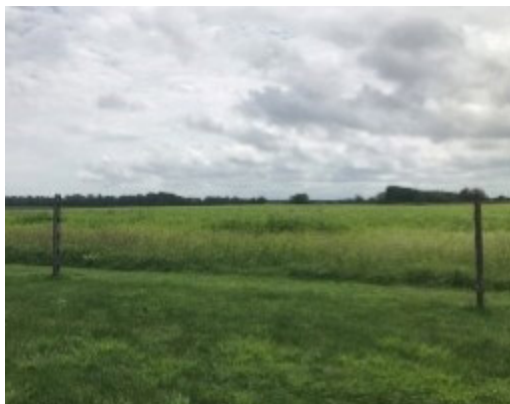
African burial ground guided visitation