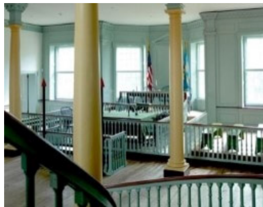
Division programs in September 2021