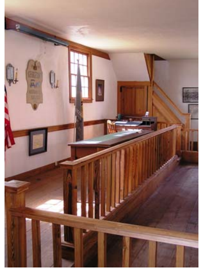
Exterior and interior photos of the Old Sussex County Court House.

As the site of the first European colony in Delaware, the town now known as Lewes had been the natural choice for the location of Sussex County's first seat of government. However, with population expansion into the western sections of the county, pressure mounted to relocate the county seat to a more centralized